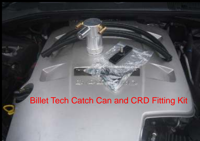
Billet Tech Catch Can and CRD Fitting Kit